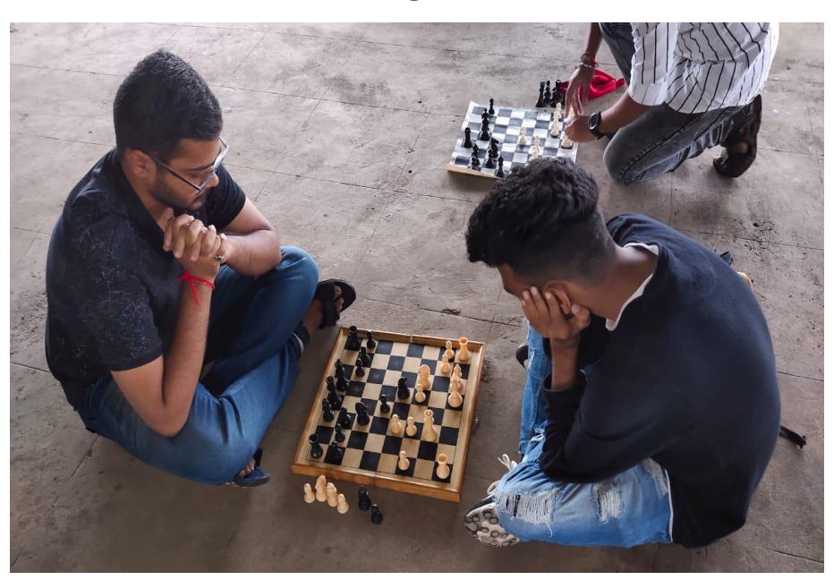
Inter-College Chess-Selection Trials, held at Western College of Commerce and Business Management on 20<sup>th</sup> August,2022.

Several Sports Workshops were held on the account of international Olympic day Western College of commerce and Business Management 2022-23