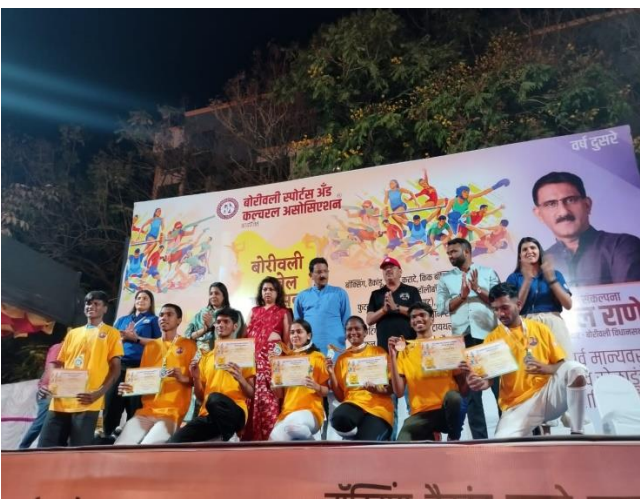
WCCBM students won the respective Medals at Borivali Khel Mahotsav on 6^{th} Feb. 2023