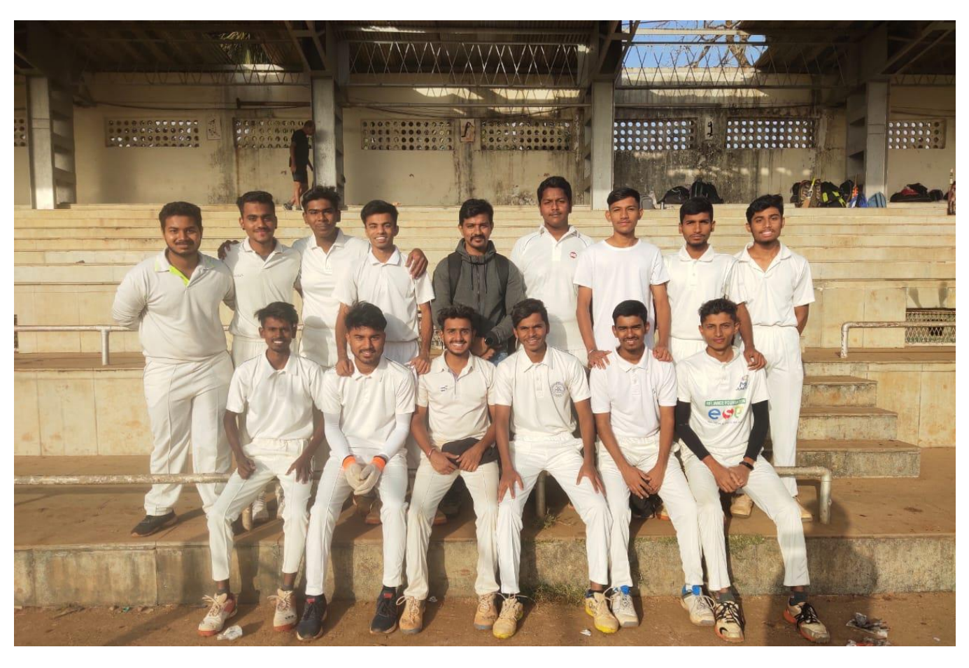
Inter-Collegiate Zone-3 Cricket Championship (M), -Participation, held at OFA cricket Ground, Ambarath on Date.